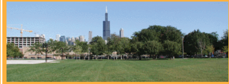
Skinner Park www.skinnerpark.org